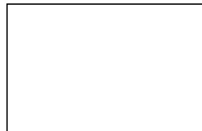
L rail Stocked in 8 metre lengths