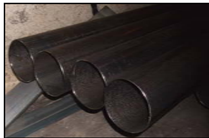
Tube 4" Tube, 16swg. Stocked in 8 metre lengths