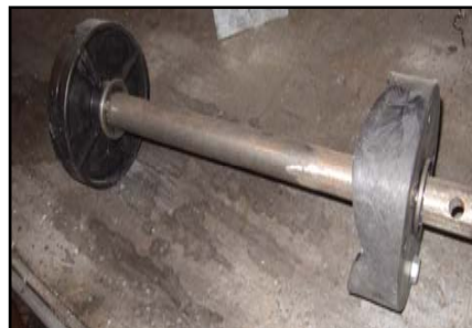
Built up dummy end To suit 4" barrels and 5" barrels