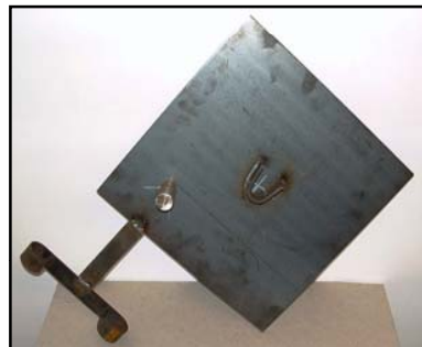
End Plate Assembly

Consisting of a stub shaft, chain guide and cup.