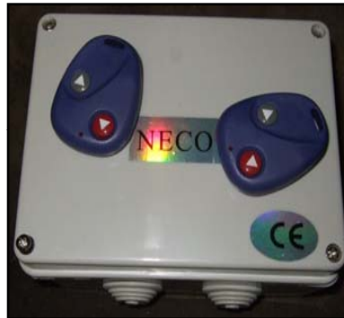
Remote Control with 2 handsets