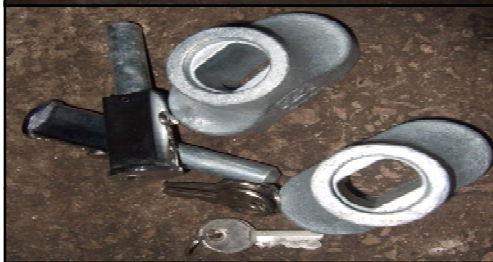
Bullet Locks & Housing