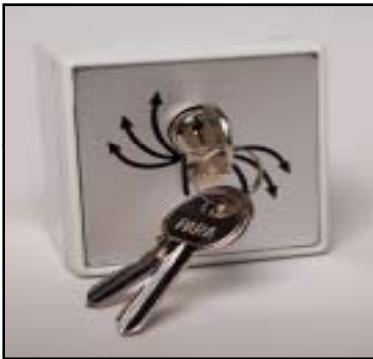
Standard Key Switch.