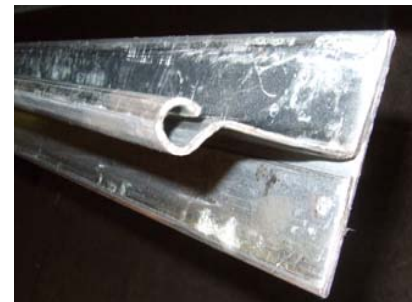
T rail Stocked in 8 Metre lengths