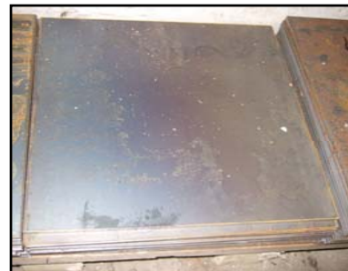
Mild Steel End Plates